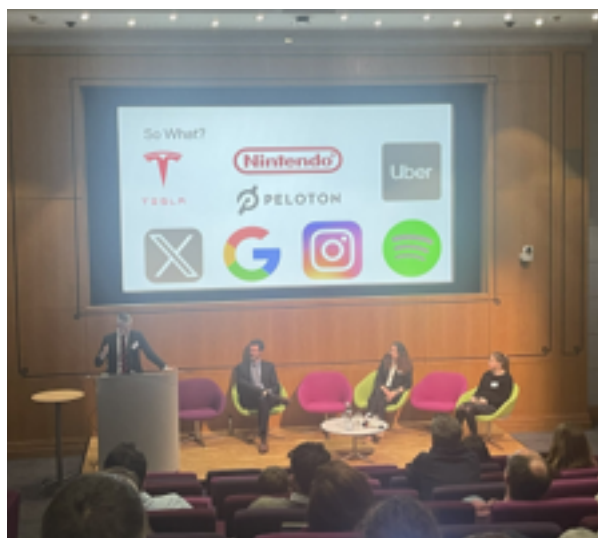
discussing AI and decision making in trauma

The session involved a long discussion about the use of machine learning and artificial intelligence to support treatment of people who are seriously ill. In these cases it is often necessary to make very quick decisions about the best course of treatment. If there is good information available, and systems are given feedback to learn from, machines may be faster and better at answering questions about the need for particular interventions. However Human decision making is better than machines when information is ambiguous or doesn't fit a previous pattern. Identifying when to use machines to aid decision making is a challenge and there is a role for Public Patient Involvement in the adoption of these new technologies. How do people feel about computers taking decisions from doctors? How can we build confidence that in some cases machines will be more reliable than humans?